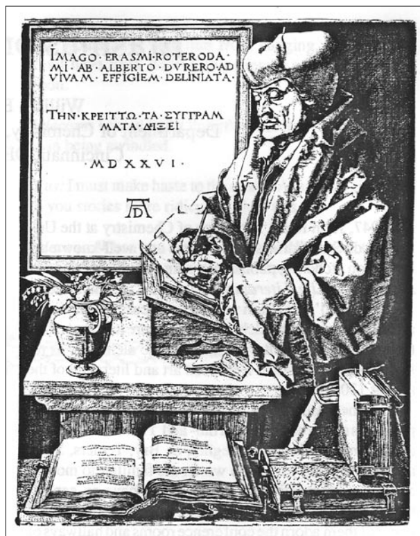
Desiderius Erasmus of Rotterdam (c. 1467-1536). An engraving by Albrecht Dürer showing Erasmus in 1526, shortly after he composed his dialog on alchemy ( Oesper Collections ).

Erasmus was also responsible for editing and/or translating works by such classical authors as Pliny, Seneca, and Lucian; for his comprehensive editions of the writings of such early church fathers as Jerome, Augustine, Origen, Irenaeus, and Cyprian; and, most importantly, for publishing the first printed edition of the New Testament in the original Greek. Indeed, the modern comprehensive English translation of his collected works, currently being published by the University of Toronto Press, promises to exceed more than 88 volumes before it is completed (14).