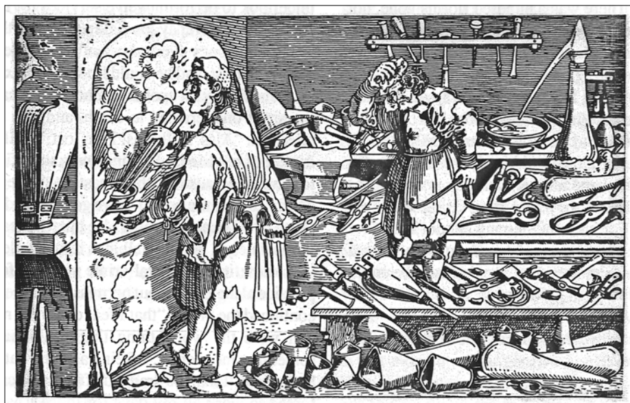
The alchemist and his assistant, a woodcut by Hans Weiditz first published in 1532 but thought to have been done about 1520, thus making it almost exactly contemporaneous with Erasmus' dialog on alchemy.

Lalus: You shall hear the alchemist by and by. "This good fortune," says he, "I have had from a child, that I learned that most desirable of arts, alchemy, the very marrow, I call it, of all philosophy." At the very mention of alchemy, Balbinus raised himself a little with an involuntary motion, then with a deep sigh bade him proceed. The priest continued: "But miserable man that I am," said he, "by not falling into the right way!" When Balbinus asked him what way